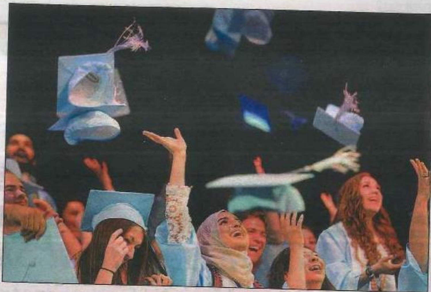
Graduates throw their mortarboards into the air.